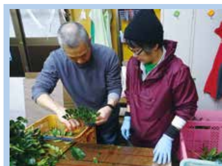
Training of shipping adjustments by farming instructors

(Note) Farming instructors are those who have excellent credentials in the industry and can train other farmers. In December 2016, the Tokyo Metropolitan Government certificated 43 "Tokyo Metropolitan farming instructors" for 20 ward and municipal governments.