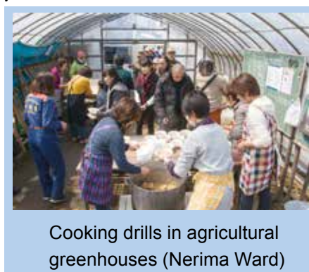
Cooking drills in agricultural greenhouses (Nerima Ward)

(Note) U-turn farmlands: Lands that were once farmland but were changed to parking lots, apartment housing and the like, and were then returned to farmland by removing gravel, mixing soils, etc. We recommend that returned farmland is specified as disaster-prevention support farmland.