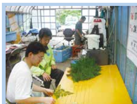
Training in techniques to adjust shipment of cut leaves (Hachijo-machi)

(Note) U-, J- and I-turns are collective terms referring to movement by residents from metropolitan areas to the provinces. U-turn stands for moving back to the person's hometown; J-turn, moving to a provincial city near the person's hometown; and I-turn, moving to a province other than the person's hometown.