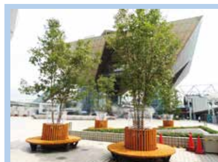
Demonstration of experiments for a portable greening system