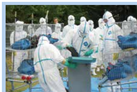
Epidemic prevention drills based on possible outbreaks