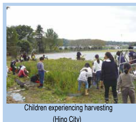
Children experiencing harvesting (Hino City)