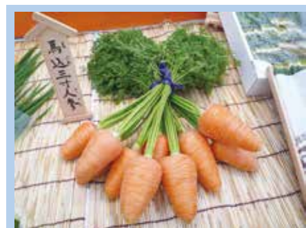
Magome Sanzun carrot (Edo-Tokyo Vegetable)