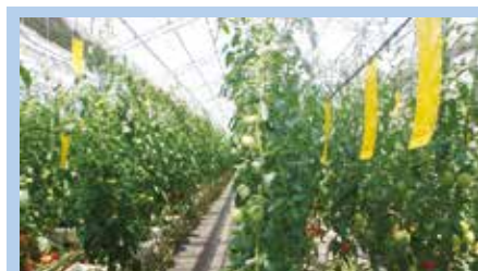
Production of tomatoes by "barrel cultivation system"